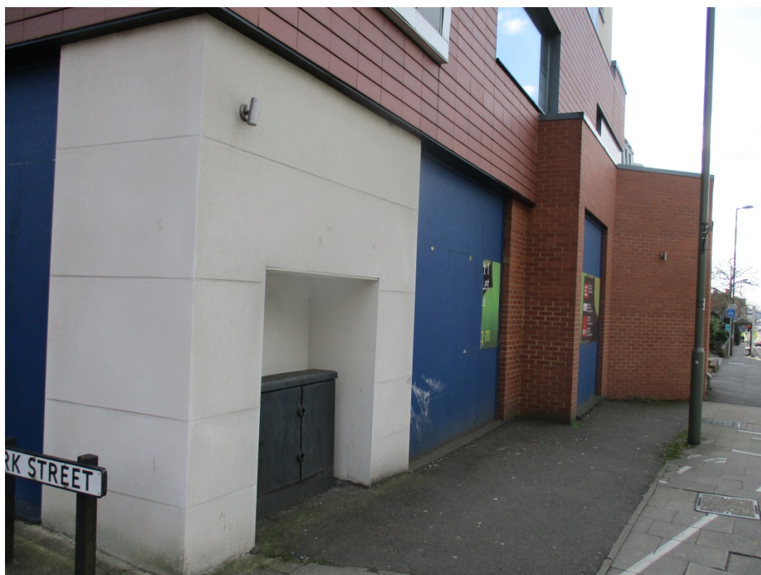
View from London Road