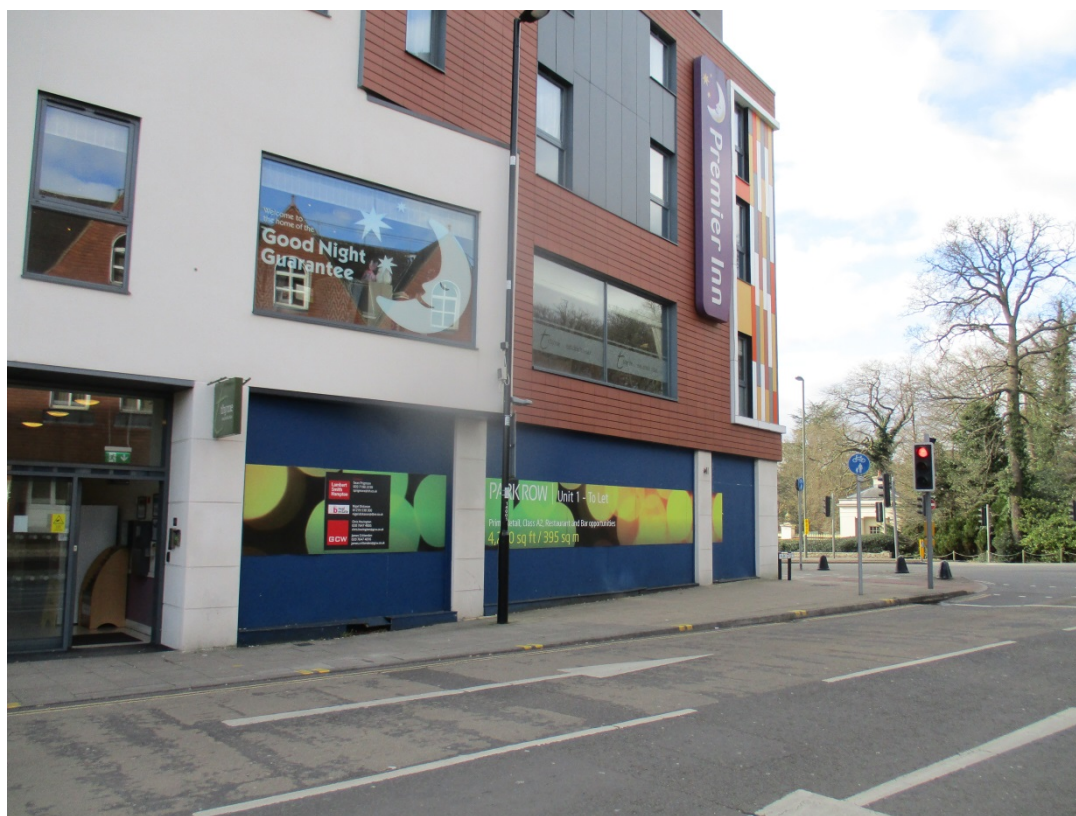
View from Park Street

16/0156 – 12-16 PARK STREET & 191 LONDON ROAD, CAMBERLEY